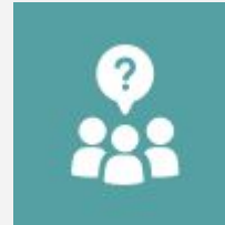
2. Stages of the project-based learning approach