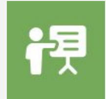
3. Class environment